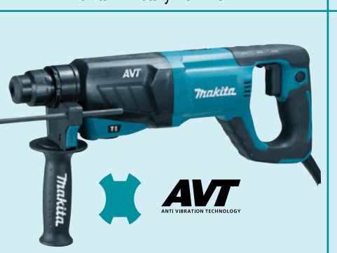
HR2641 Makita 1" Rotary Hammer