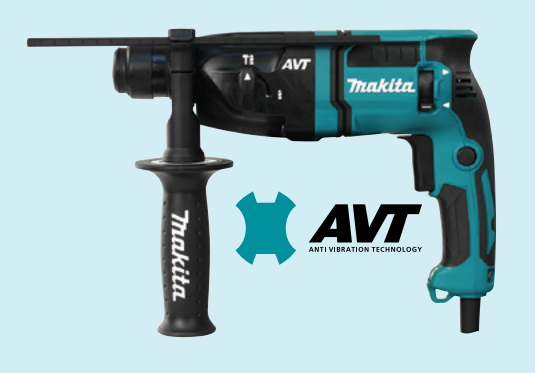
HR1841F Makita 11/16" Rotary Hammer